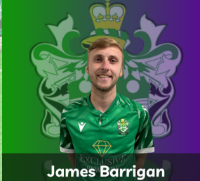
PLAYER SPONSORSHIP AVAILABLE